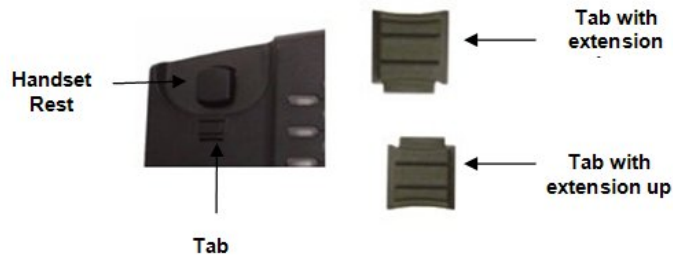
Figure 4: Placing tab for mounting phone to wall